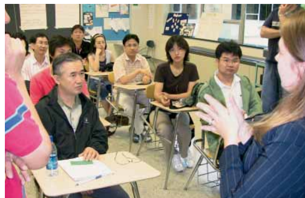
Visiting Korean math teachers at Brown County High School